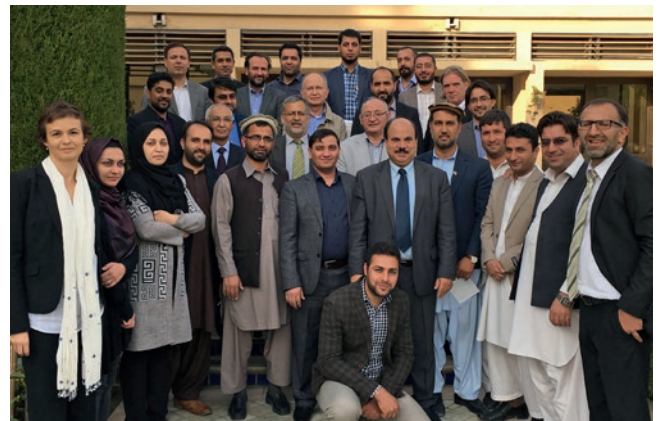
Integrated and Returning Experts working in Afghanistan

As part of its Return of Talents Afghanistan programme, the German Government also supports Afghan experts and managers who have studied in Germany. Graduates of German and European universities are being placed and financially supported as returning experts in development-related positions at Afghan ministries and authorities. They are also involved in developing state structures outside of Kabul, for example in Herat, Kandahar, Khost and Nangarhar Provinces. Demand for returning experts among Afghan employers has risen steadily in recent years.