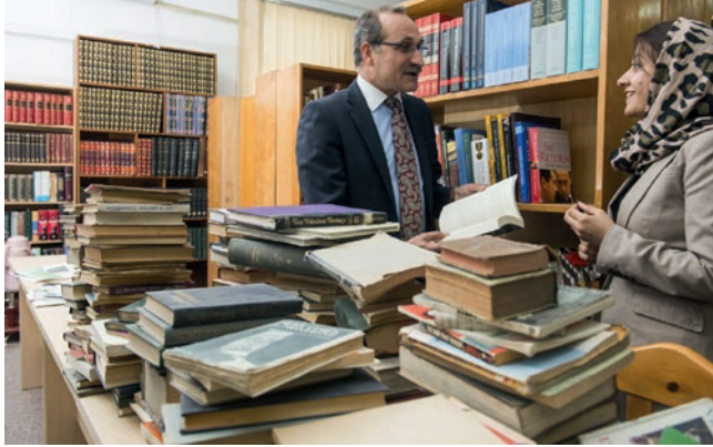
An expert advising Afghan partner institutions

An integrated expert has been working in an advisory role on the Independent Joint Anti-Corruption Monitoring and Evaluation Committee (MEC) since 2014, driving investigations into the Kabul Bank scandal among other things. He has also used his expertise to help make the MEC the first port of call for the media on this issue.