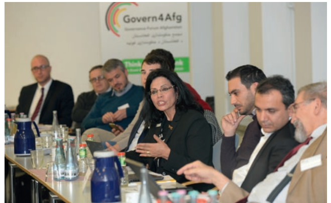
Presenting and discussing a strategy paper

Govern4Afg encourages actors to address the aforementioned issues through a series of events in Kabul and selected Northern provinces. In order to inform relevant policymakers on the outcome of these discussion processes, the key findings and recommendations will be presented in thematic factsheets and policy briefs that can be accessed at www.govern4afg.org .