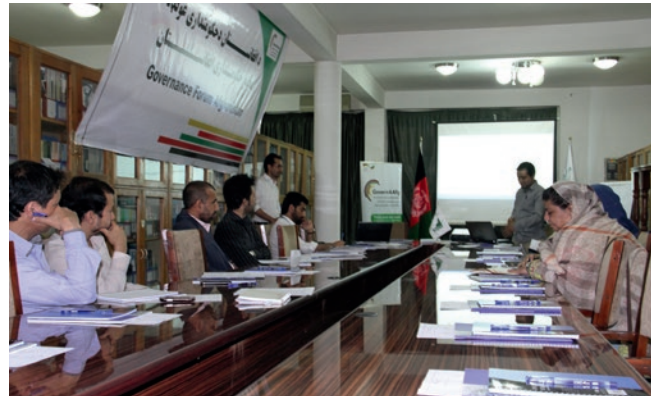
Discussion event organised by the think tank Govern4Afg

The expert team is expected to publish its findings on these topics in mid-2017.