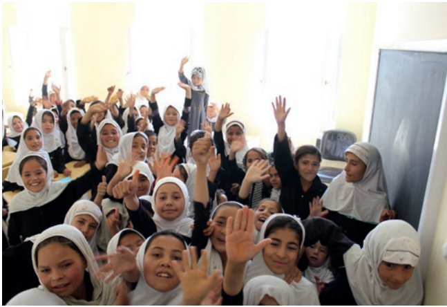
Children at the opening of their new school building near Mazar-e Sharif