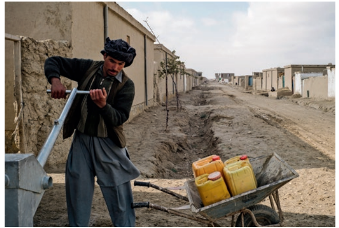
An internally displaced person pumps water for his family out of a newly-built well