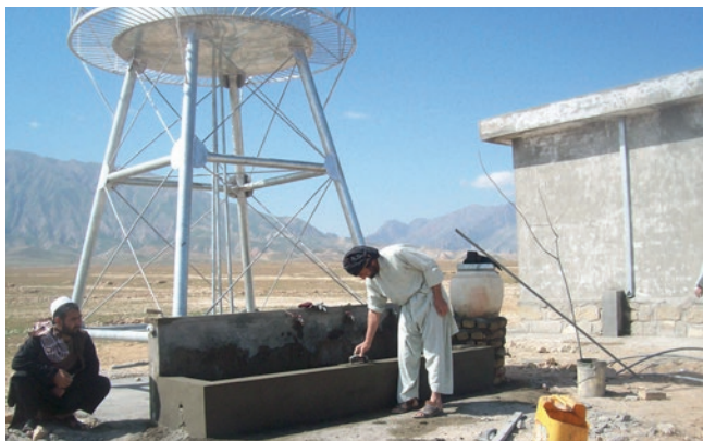
Small infrastructure projects along the road improve the local population's living conditions

to avert the risk of the road being eroded by spring flooding. The road was completed in 2013, reducing the 3.5 hour travel time from Chahar Kent to Mazar-e Sharif to 1.5 hours.