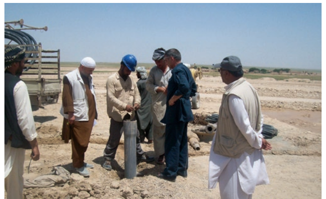
Construction works are mostly implemented by local companies supported by international experts

The Mazar-e Sharif to Chahar Kent road connects Balkh's provincial capital with the agricultural district of Chahar Kent 42 km to the South. The first 10 kilometres of the road have now