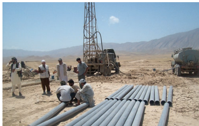
Improved road connections facilitate the rural area's social and economic development in the respective provinces

In order to further improve the living conditions of the population, the programme is undertaking smaller projects along the roads as required. For example, the population of Char Darrah now has faster access to medical care in the mobile health unit and at the health centre in Kholm. School students at Char-Darrah high school have also received schoolbooks for the first time. And residents can now draw clean drinking water from rehabilitated wells in Hayat and Kholm. Additionally, seven villages close to the roads now have access to clean drinking water from newly constructed wells.