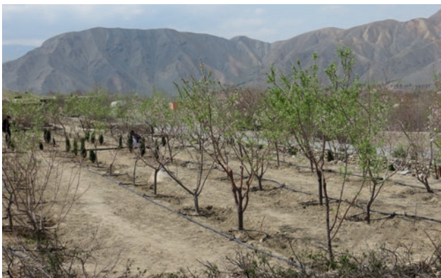
Irrigation systems for agricultural development

In 2016, KfW initiated a new project aiming to improve economic infrastructure for wheat growing. The project has enabled the rehabilitation of small-scale irrigation systems in Afghanistan's Northern provinces and of individual roads, bridges and storage facilities.