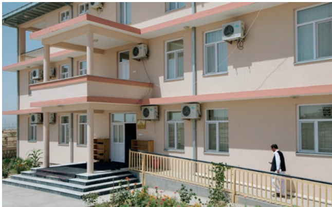
A newly constructed administrative building for the Afghan Ministry of Justice in Kunduz province