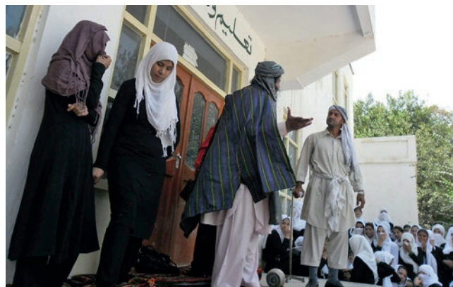
Theatre performances teach students about their rights in a playful way